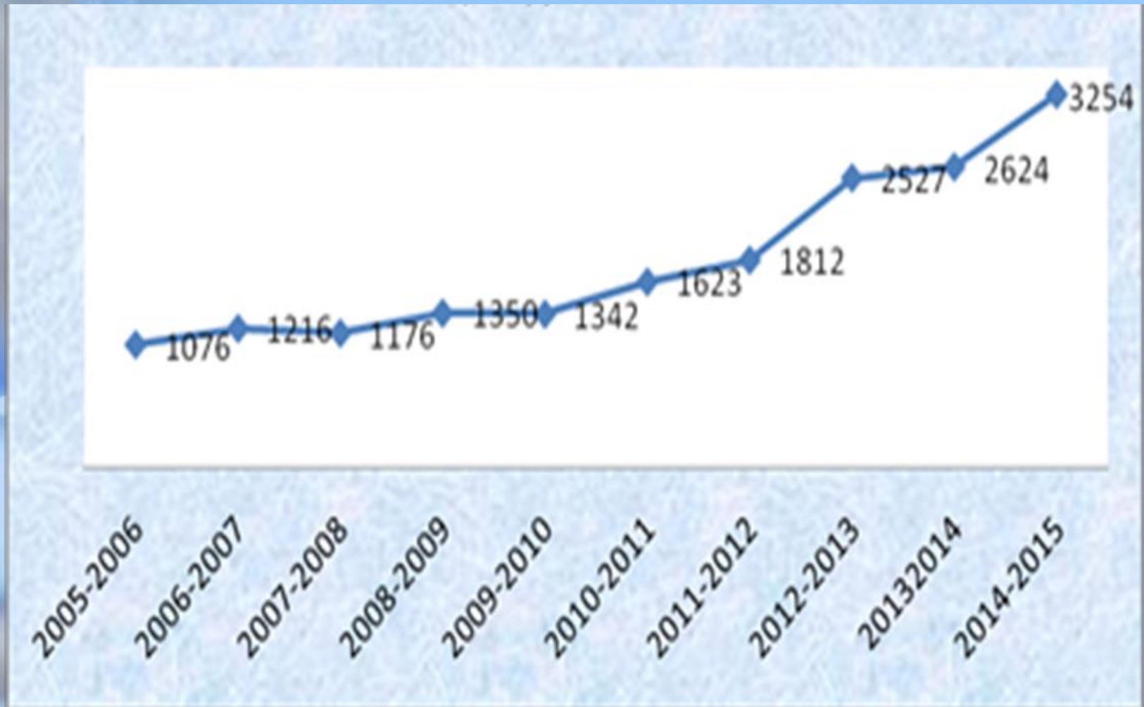
Graph 1: The trends of yearly production of nurse and midwifery